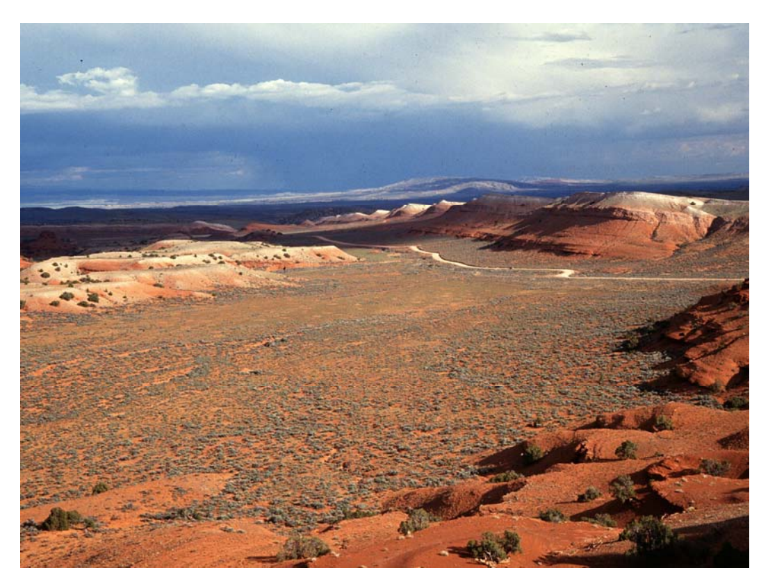
Photgraph 3. Sagebrush steppe near Gyp Spring.