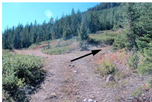
Second trailhead. Arrow points into gully.

At the top end of #21041, follow the left unsigned track for about 100 ft., then turn right (uphill) into the bottom of a small gully. Push through the brush for about 40 up the bottom of the gully. Look for a 3 ft. (approx.) boulder and a couple sawed tree stumps on the left side of the gully. At that point climb up the right (north) side of the gully and push through a grove of several small trees. Here, on the side of the gully, look for a trail paralleling the gully and close to its edge. This trail is like a game trail - not constructed. You should find this game trail less than 100 feet from where you entered the bottom of the gully.