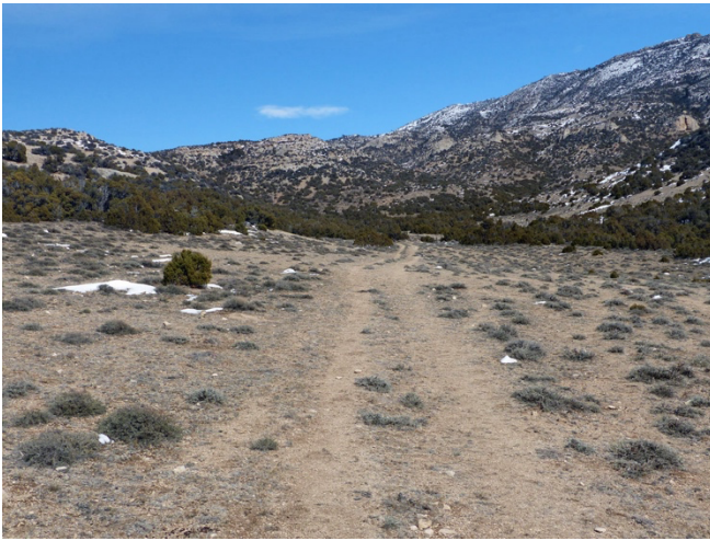
The two-track heading NE toward guzzler.

1.7 miles: Guzzler. From the water catchment and guzzler follow horse trails east a bit around the base of a hill, then curve north following the main drainage on your choice of intermittent, intersecting horse trails. There are several side drainages and rocky prominences to the east, but continue north as the canyon bottom narrows with steeper sides. It is about 0.8 miles from the guzzler to the arch. Stay near the bottom of the drainage below the rocky cliffs to the west. The arch is on the right (east) side of the drainage, but the last part may be easier walking on the slope west of the drainage. From there the arch can be seen high on the opposite (east) side, and a route up to it can be selected.