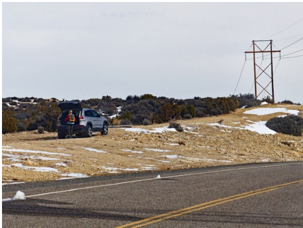
Park west of Hwy WY #37 just north of cattleguard

“The Sykes Arch trail would be managed solely for hiking use. This trail was envisioned to be marked with signs or cairns and would not be constructed except for specific areas where trail alignment would help concentrate hiking use to more appropriate locations. ... This trail ... would not be improved to the level that would allow equestrian passage. No mechanized use would be allowed.” (Appendix E, page E-29)