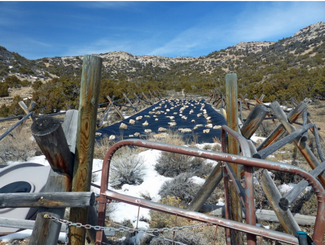
Water Catchment and Guzzler

1.7 miles: Guzzler. From the water catchment and guzzler follow horse trails east a bit around the base of a hill, then curve north following the main drainage on your choice of intermittent, intersecting horse trails. There are several side drainages and rocky prominences to the east, but continue north as the canyon bottom narrows with steeper sides. It is about 0.8 miles from the guzzler to the arch. Stay near the bottom of the drainage below the rocky cliffs to the west. The arch is on the right (east) side of the drainage, but the last part may be easier walking on the slope west of the drainage. From there the arch can be seen high on the opposite (east) side, and a route up to it can be selected.