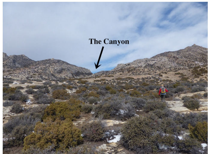
The brushy flat, and the canyon.

0.3 miles: Cross shallow north-south drainage and enter the narrow, rocky and winding canyon heading northwest. This is now BCNRA Recommended Wilderness.