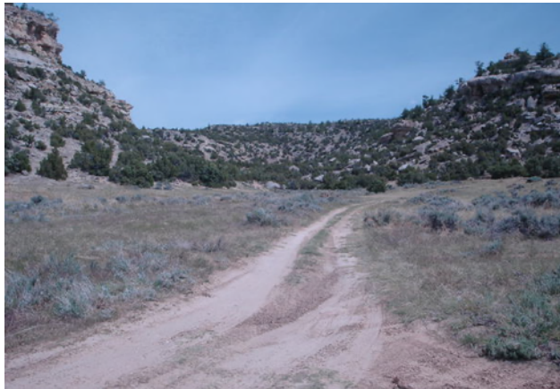
Road entering rocky canyon at 0.9 mile junction