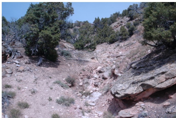
Views of the hiking route climbing out of the canyon

BLM has designated the Rocky Juniper Trail as a "non-mechanized" route in the 2021 Pryors Travel Plan. That means no wheeled vehicles (with or without motors) are permitted. Currently there are no trail signs. We hope that sometime soon BLM will install some kind of trail markers.