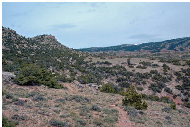
View north from the saddle. Note trail.