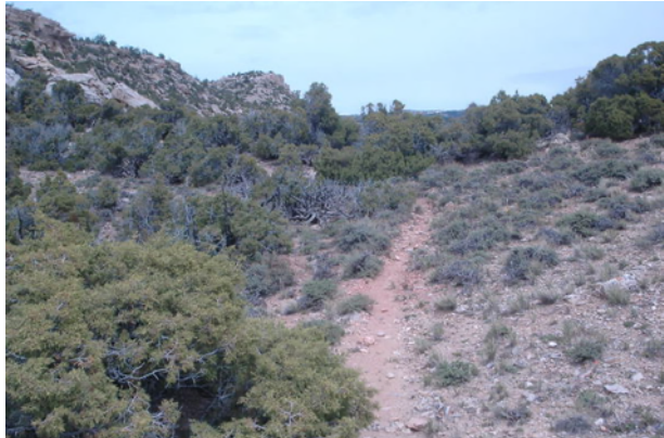
Typical trail after climbing out of canyon.