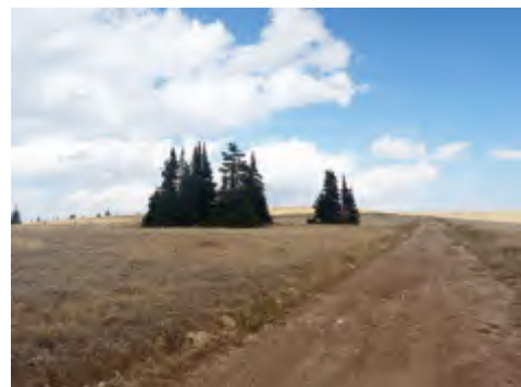
Isolated cluster of trees near trailhead

Pryor Mountain Road is seasonally closed until May 22 at the Crooked Creek Road junction (mile 30.3). This is 8 miles before the Lost Water trailhead. This closure might be extended in some heavy snow years.