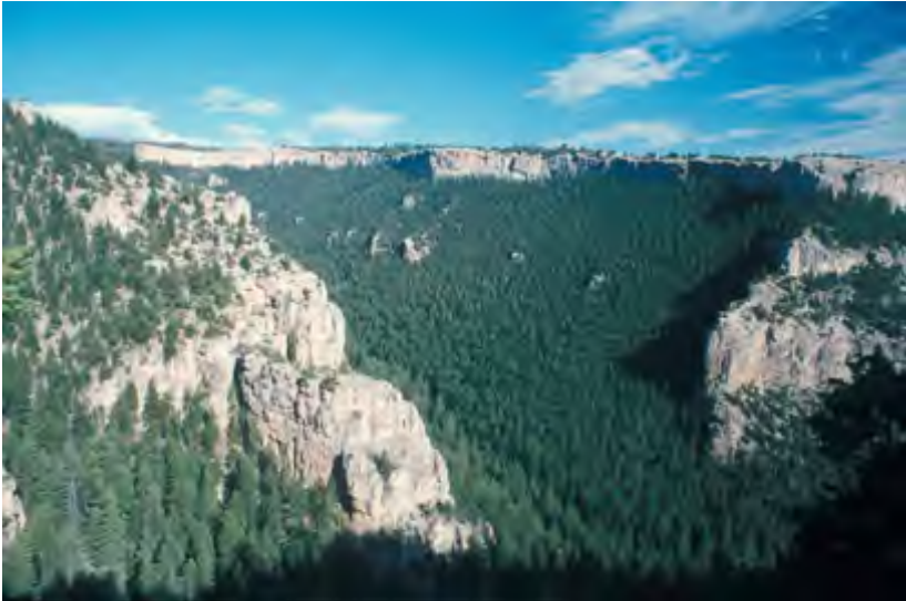
Looking north up Lost Water Canyon.

This hike also makes a good overnight backpack trip. That allows quiet enjoyment of the evening and morning light, and a night in the wild. There is no water source; you must carry all you will need. The advantage is that most of the water will be carried downhill – not uphill.