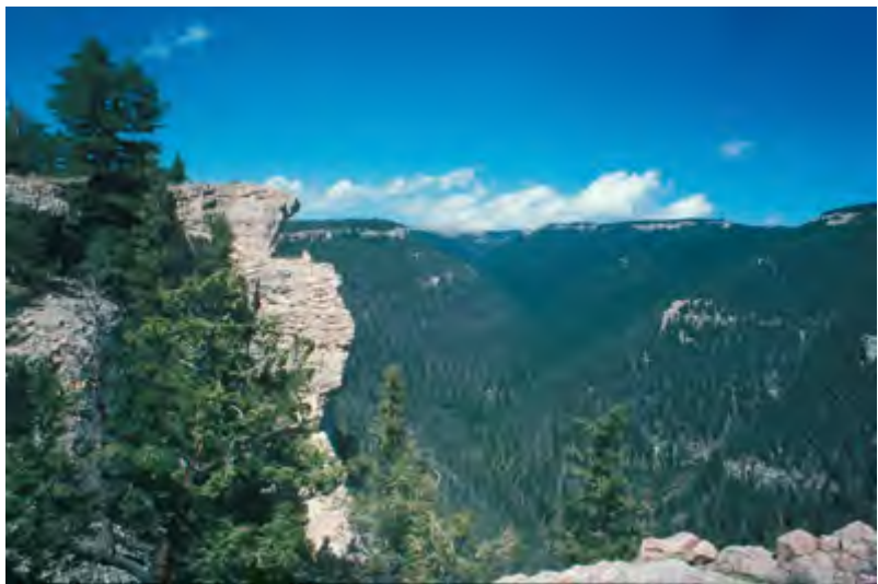
Lost Water canyon from Peregrine Point – looking north.

4.1 miles: Peregrine Point. At this point Lost Water Canyon which has been draining fairly straight south turns sharply toward the southwest. It is a good destination for your hike. Relax and enjoy the wild view in all directions. And/or wander and explore the area. The elevation is 1,400 feet below the trailhead. The heavy timber on the canyon rim has thinned, there is more open grass, and you will notice changes in the species of wildflowers blooming.