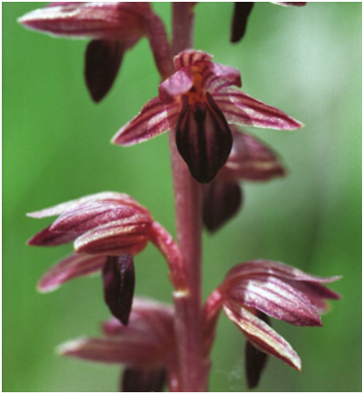
Striped Coralroot Orchid, Corallorhiza striata