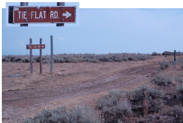
Tie Flat Rd. #2104

Follow #2104 for 0.1 mile to a junction with a two track trail to the right (southwest). This junction is the trailhead. Route #2104 continues straight ahead with no obvious trail sign. There is a “Crater Ice Cave Trail No. 31” trail sign, but unfortunately it is poorly placed 100 yards from Tie Flat Rd. where it is hard to see. It is too small to read until you walk much closer. Look for it on the right (southwest). There is a “No Motor Vehicles” sign beside the trail sign