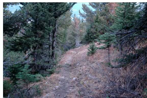
Part of Switchback Trail