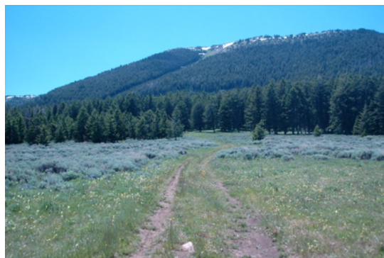
Trailhead and beginning of trail.

Walk southwest up the two-track trail for 0.4 miles. At first it is in open grassland and sage, but soon enters the trees. After 0.4 miles, and 300 feet elevation gain, the track arrives at a flat opening in the trees. The two old logging tracks to the right (north), signed #2002A and #2002A1, are motor-legal, but little used.